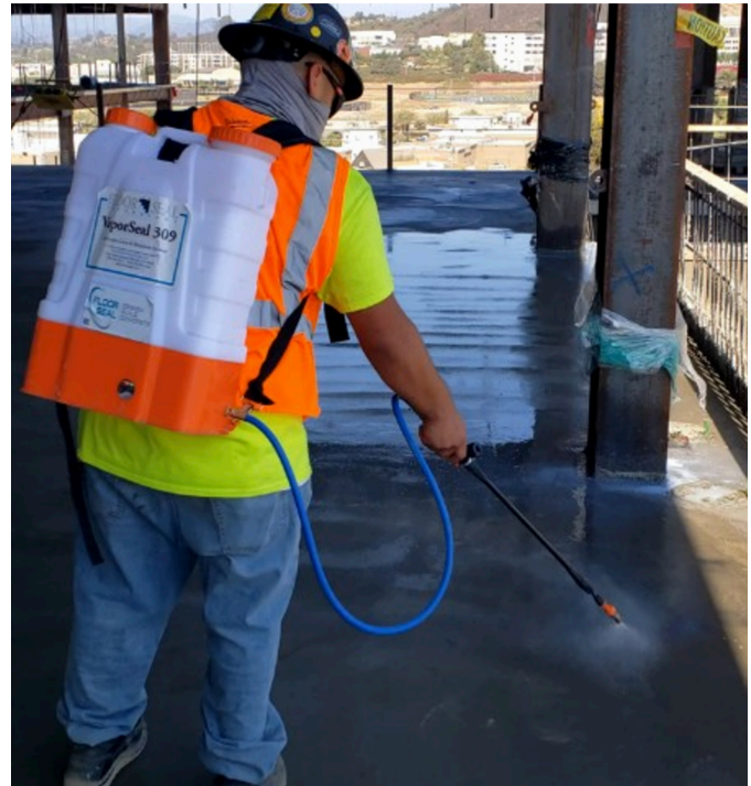
VaporSeal 309 curing + moisture control treatment

Expect floor flatness of FF 35 (min. FF22) and FL20 (min. FL 18) when tested to ASTM E1155 at 72 hours after placement of concrete.